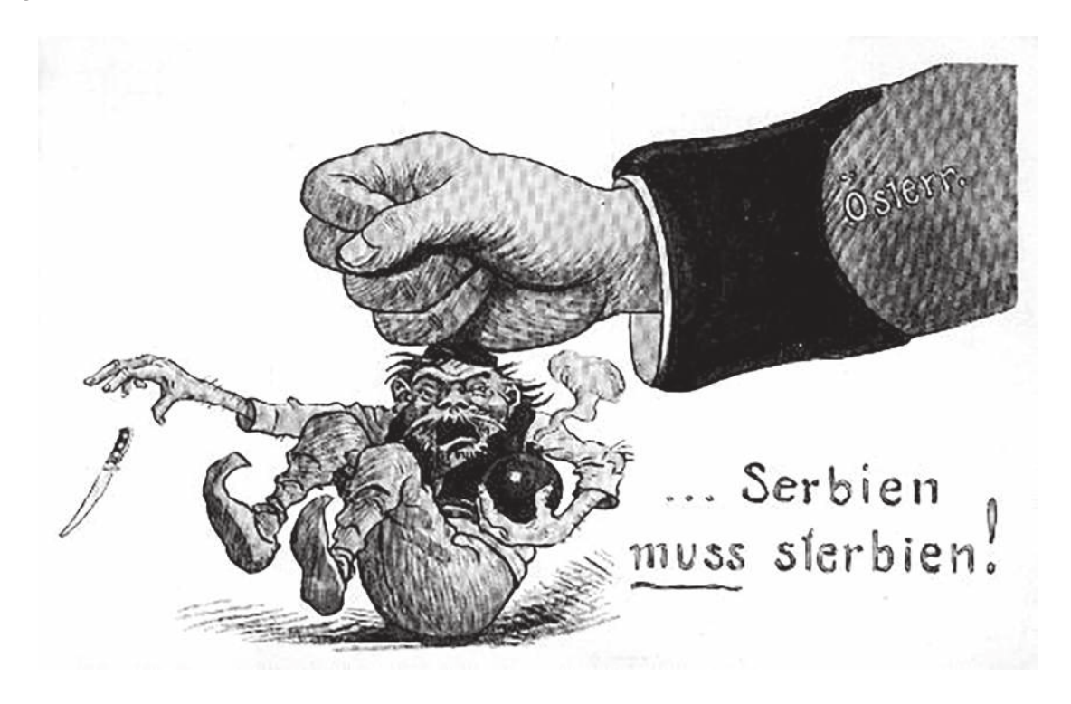
An Austrian cartoon published shortly after the assassination of Archduke Ferdinand. The words say 'Serbia must die!' 'Osterr' means Austria.