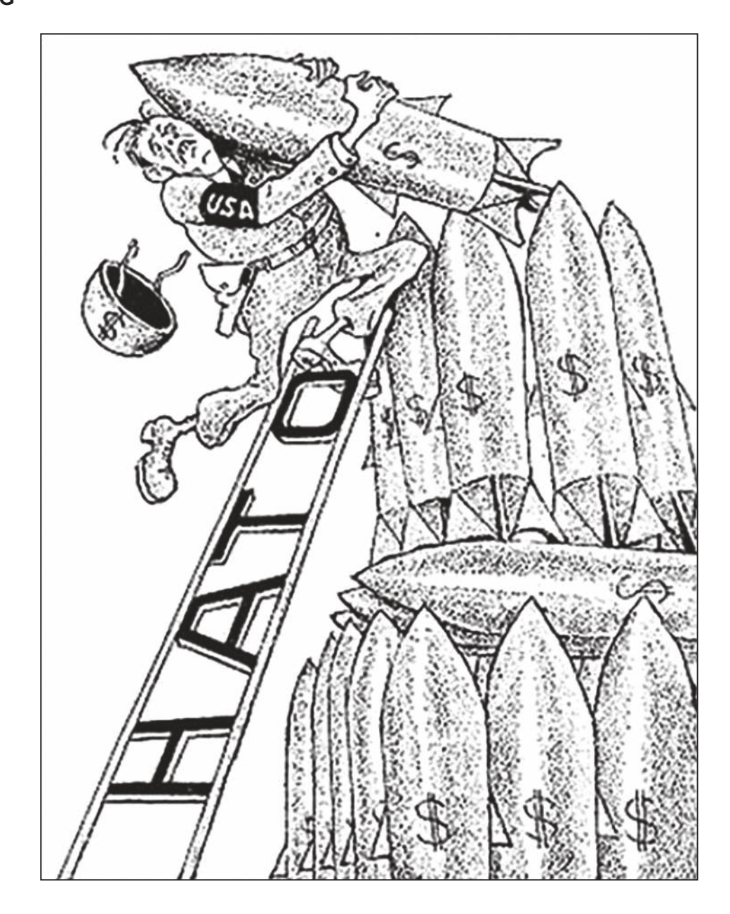
A cartoon published in the Soviet Union in 1949. The word on the ladder is 'NATO'.